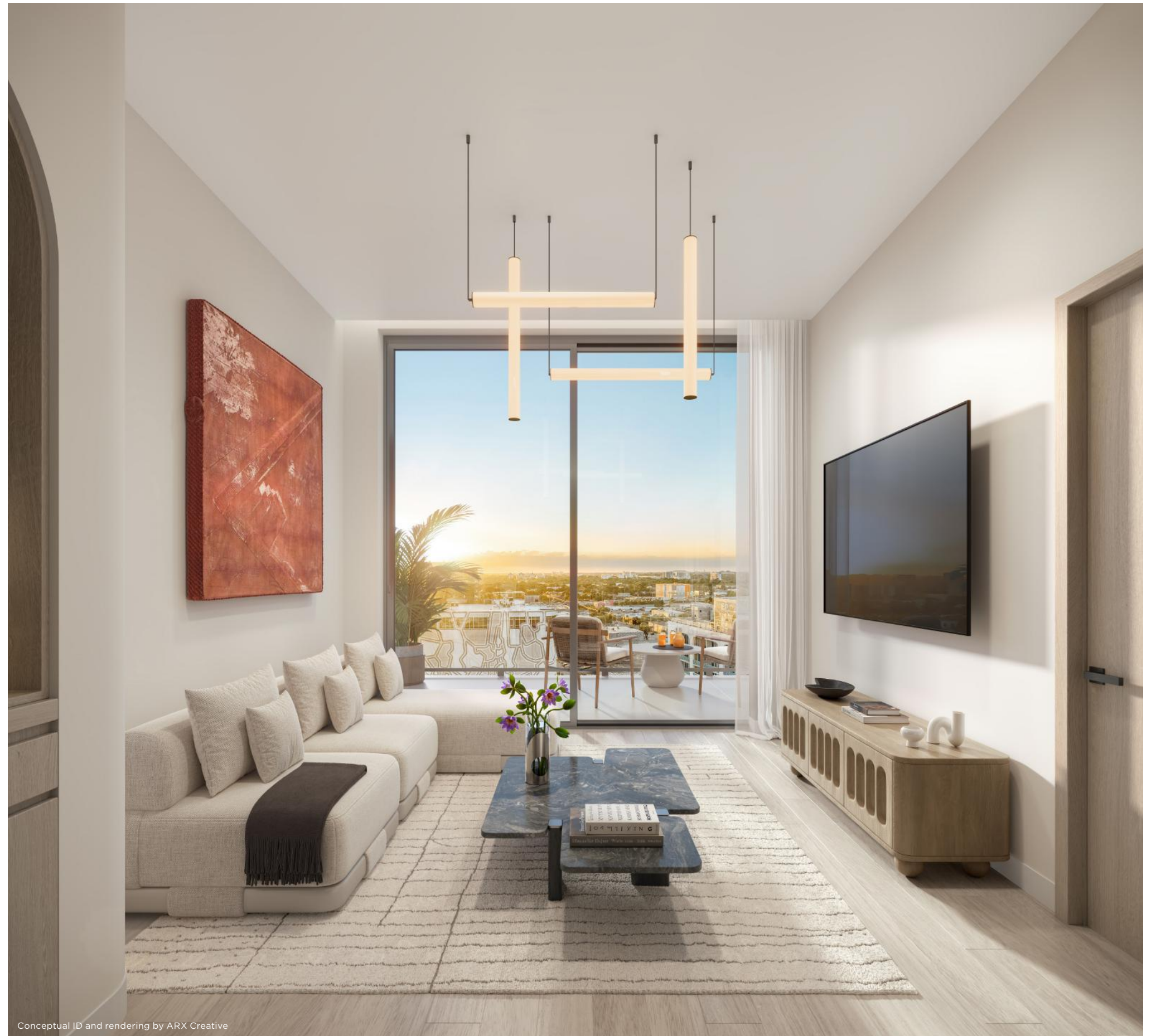
Conceptual ID and rendering by ARX Creative